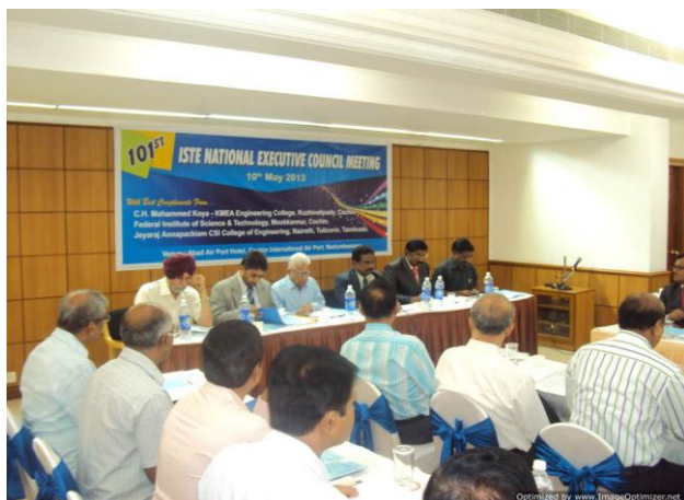
101 NC meeting in progress at Kochi