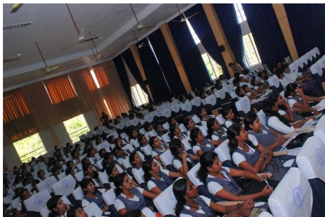
A section of the audience