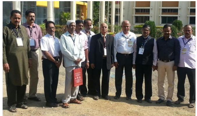
Team from Kerala with Organisers

ISTE Kerala Section team attended National Convention at Amaravathi during 9 to 11 th Jan 2016. A one day workshop was organized on Skill Development. Honourable Chief Minister Shri Devendra Fadnavis, Maharashtra inaugurated the 45th annual national convention on 9th January 2016. In his speech he stressed the need of quality improvement of technical education system in the country.