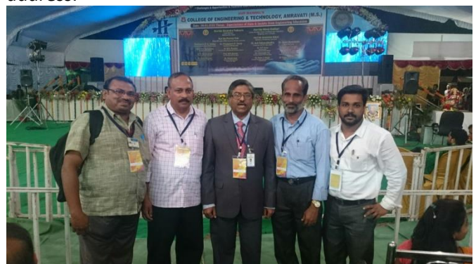
At Amaravathi The team from kerala

National awards are distributed by Honourable Sri Nithin Gadkahari, Union Minister for Transport and Shipping. Sustainable development has become imperative and is accepted by global community. Technical education has to play a vital role in achieving the goal were excerpts from his address.