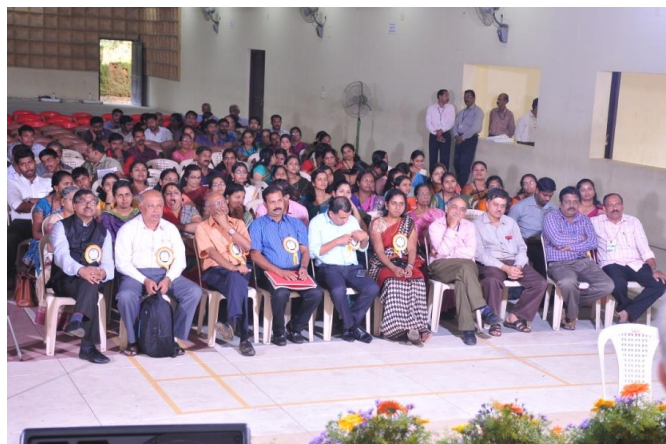
Audience 26 th ISTE convention at MCET

The secret of getting ahead is getting started. Mark Twain