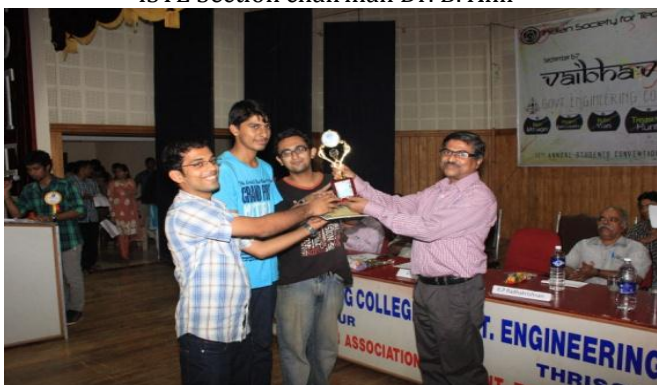
Winners of NIT Calicut receiving Trophy