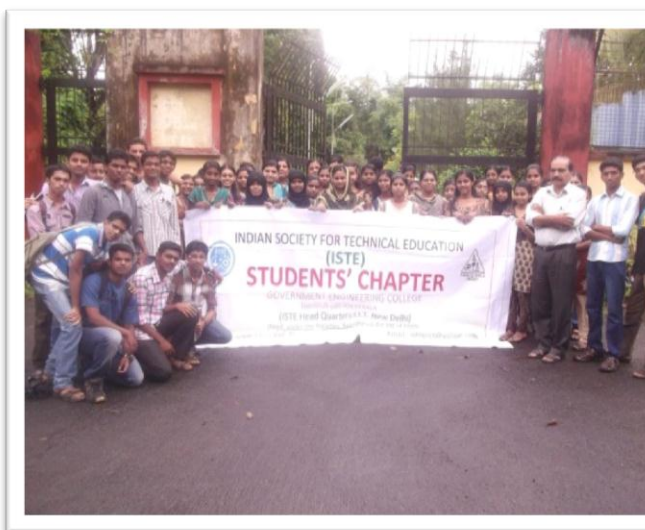
Students in front of Akashavani, Thrissur