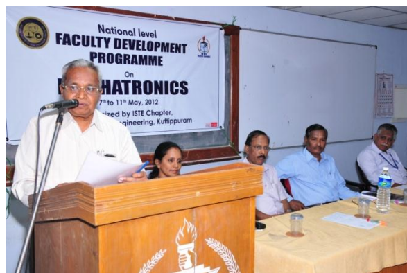
Inauguration of the FDP on Mechatronics