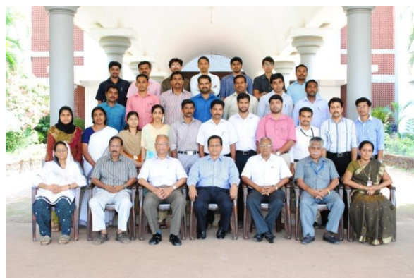
Participants and Resources persons of FDP