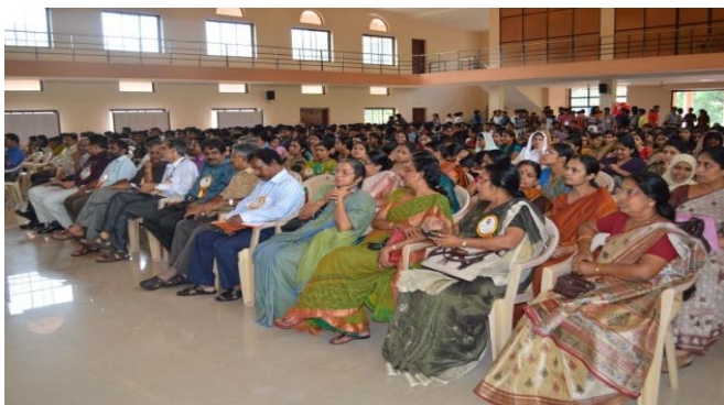
Delegates of Vaibhava 2012, Students convention